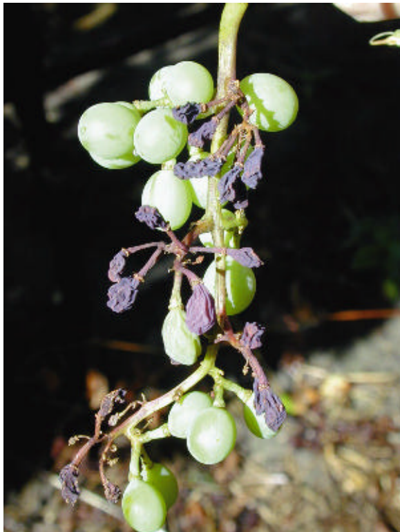
Downy Mildew on Grapes