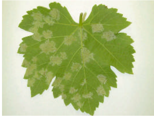
Downey Mildew on top of juvenile leaf